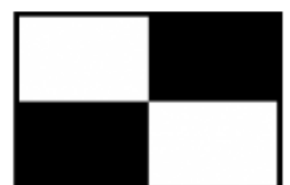
Surfing area No swimming