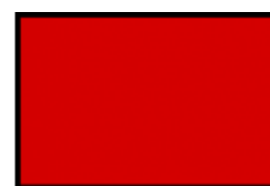
DANGER No swimming