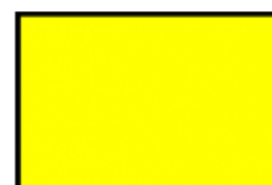
CAUTION Seek advice