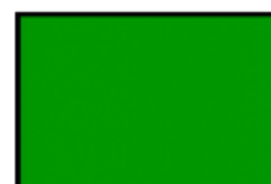
Safe to swim