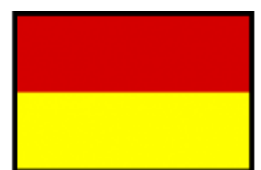
Lifeguard on duty