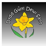
St David's Day

Wales has lots of mountains and valleys and it's own language.